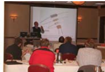
Don't just hear about it